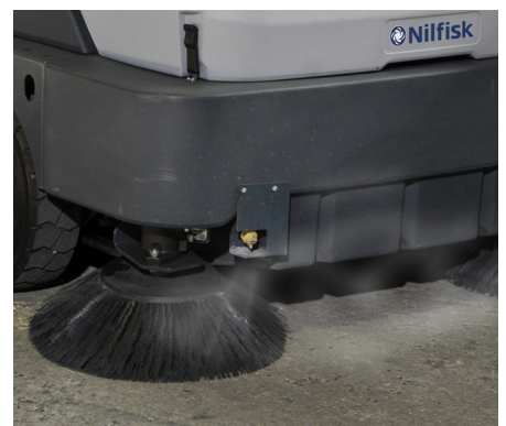
The exclusive DustGuard™ system effectively controls airborne dust by providing a fine mist of moisture to the front and side brushes