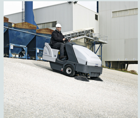
Ramp climbing ability - up to 25%