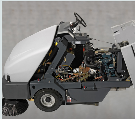
All major components are accessible quickly without the need for tools. Maintenance is fast and simple