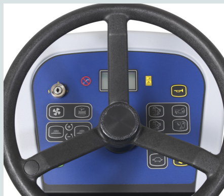
Control panel with intuitive icon buttons and modern display to achieve best in class ease of use