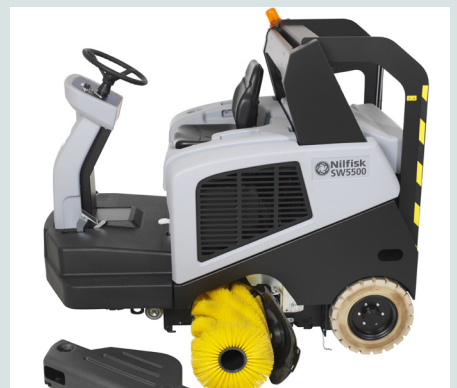
Fast and easy replacement of main components without any tools to make daily operations easy and reduce downtime